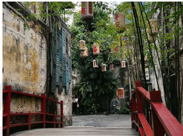
Kwai Chai Hong