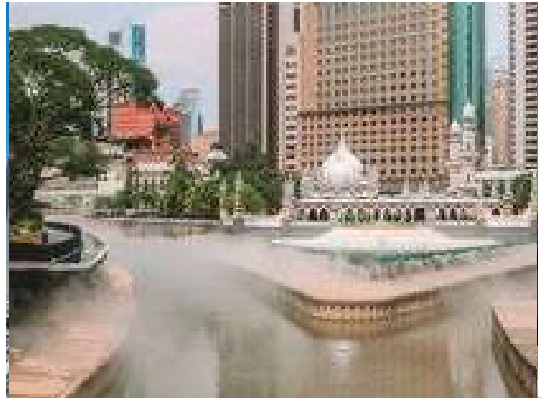
River of Live