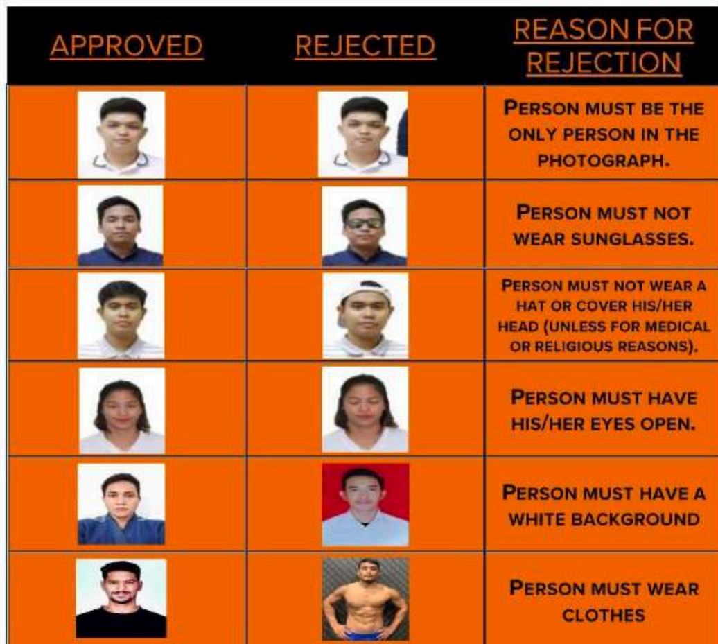
Photo Requirements For Registration (Athletes/Coaches/Referees/Officials)

REGISTRATIONS WITH PICTURES THAT DO NOT FULFULL THE ABOVE REQUIREMENTS WILL BE DELETED AND NEED TO BE REGISTERED CORRECTLY.